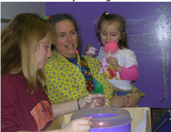
Enjoying cotton candy at Family Fun Night!